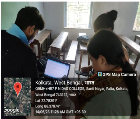
ICT TRAINING PROGRAMME

18. Evidence produced (Lists, Certificates, letters, newspaper cuttings, etc.):